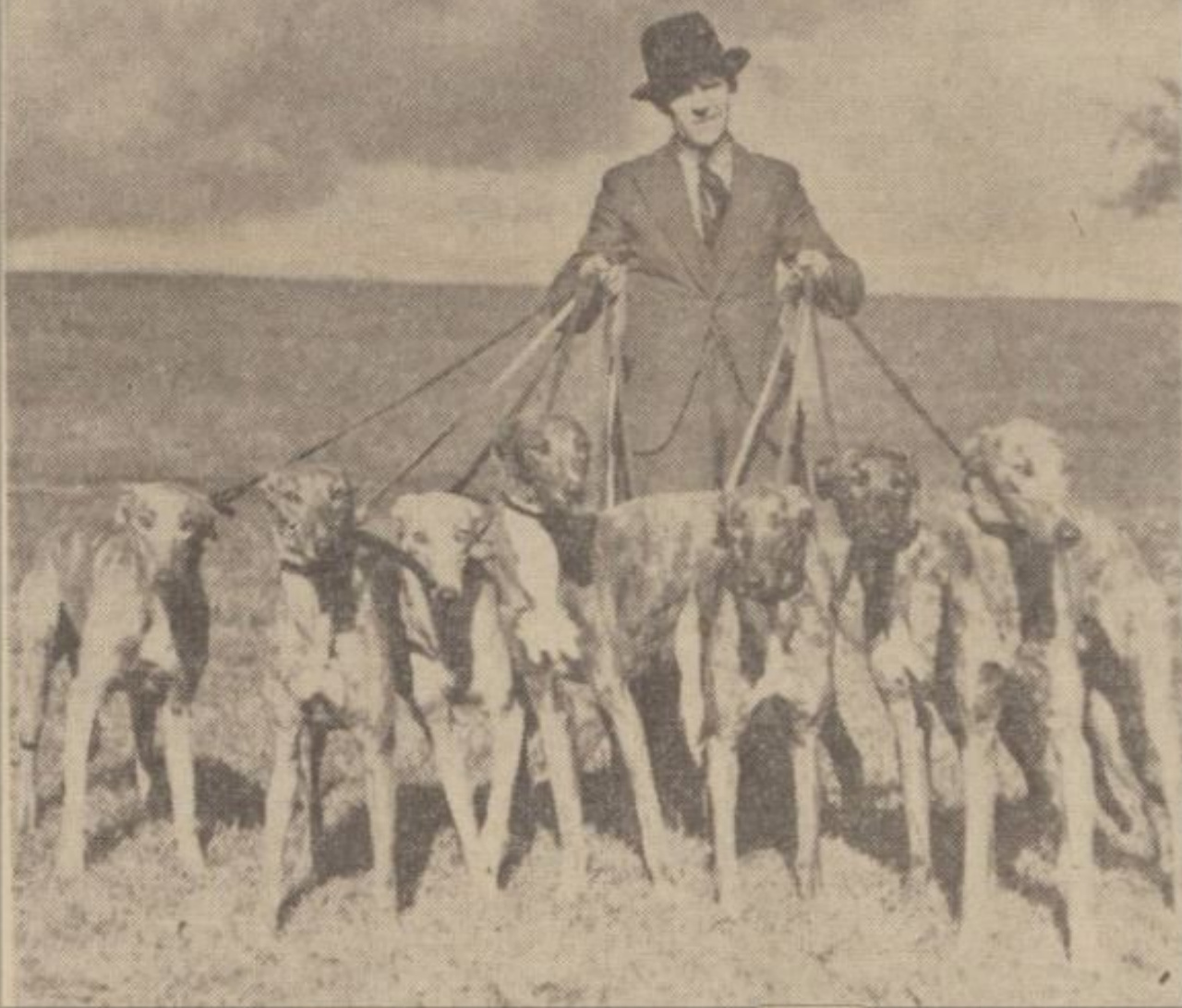
PICTURESQUE study at Trentham this morning—a string of greyhounds belonging to the Cobridge track being exercised. They have all been bred at the Trentham kennels.

Albion Greyhounds, Trentham Based in the former Hunt Kennels off Whitmore Road